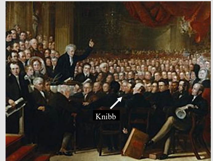
1840 World Anti-Slavery Convention in Exeter Hall. There is a copy of this painting in the Council offices in Bowling Green Road, Kettering, England.

1832: William spoke at meetings in London and all over England informing of the horrors of slavery and sympathy was shown all over the country. The Christian Church was aroused by the events that happened in Jamaica and the descriptions given by William, and the public feeling for emancipation grew in strength with petitions to the House of Lords from all parts of the country from all classes. William travelled to St Andrews, Dundee and Newcastle, Cork and Dublin telling of the horrors of slavery. 1842: William's visit to England coincided with the Jubilee meetings of the Baptist Missionary Society. At the annual meeting of the Baptist Society on 21st June, William was there to represent Jamaica. He was told not to meddle in politics but he disobeyed this.